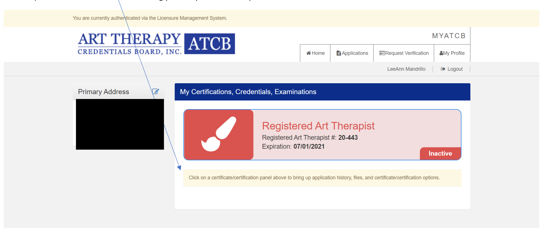
Step 2: Click on credential. This will bring you into your credential portal.