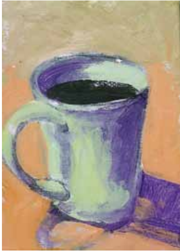
“Week Coffee #7” by Ed Oechsle, acrylic on canvas

Examination (ATCBE) and national Board Certification (ATR-BC) as the standards for qualifications as licensed art therapists. From the point of view of an employer, and increasingly state licensure boards, it is important to hire credentialed art therapy professionals. ☞