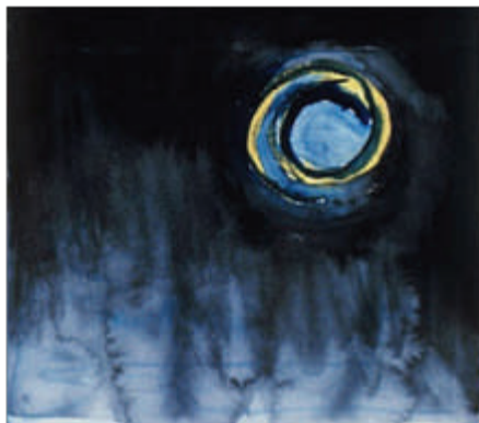
Tide: First Light (detail) watercolor on paper, 1996

My people arrived in the United States from across the Pacific Ocean. They settled in Southern California, where my Philippine-born parents encountered a community rich in cultural diversity and chose to raise their four children among the local native, transplant and immigrant populace. I grew up in a household and neighborhood that, while abounding in values and tradition, did not have much in the way of material wealth. My father was a US Naval Barber and my mother a homemaker and sometime garment worker. Both parents arrived in this country with no more than a high school education, a meager military salary and a barely passable grasp of the English language. While my parents were short of affluence and material possessions, they were equally generous with drawing on their skills, their form of art and how they applied it to their daily work and as constant reminders of the functionality of the creative spirit. Both parents relied on their hands, keen eyes and methodical approach to the employment they found in this country and established a foundation on which they raised their family. My siblings and I discovered that