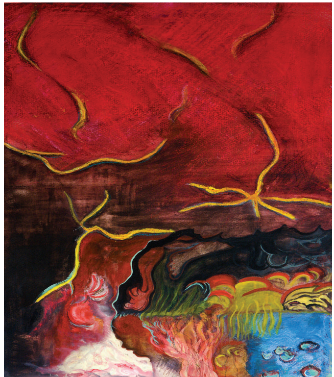
Title: Drowning in Memory, watercolor & oil pastel on paper, 2006