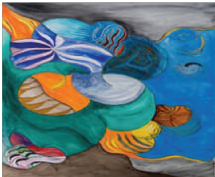
Title: Overflow, watercolor & oil pastel on paper, 2003

I thought I was never going to look back at my California roots again and hoped that the Midwest or the eastern states would pull me toward my next creative passage. But life has a curious way of turning the tables on best laid plans. After an incredible two years of being immersed in the field of Art Therapy and marrying a man who followed me to Chicago and who wanted to go back to live in rural Northern California where his parents and siblings lived, I returned to the coastal state of my birth. I came back hopeful that I would complete my postgraduate supervised hours as an art therapist and art educator to eventually achieve licensure in California as a clinician.