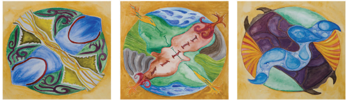
Title: Squaring of the Circle, watercolor on paper, 2003

I know now that no matter how much I plan, digress, and prepare for or time I take, art therapy continues to filter through my existence and is woven into all that I do.