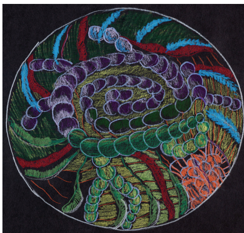
Title: J.J., color pencil on paper, 2013