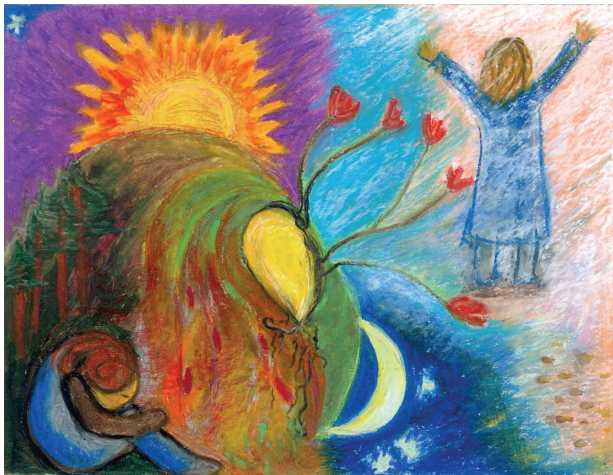
Injuries & Successes, oil pastel on paper, 2000

It is my current position as a Board Certified Art Therapist and Licensed Clinical Social Worker where I believe I am fulfilling my life purpose. These days you will find me still joyously raising my now 18-year-old son in a thriving relationship and marriage of 22 years while living on the rural north coast of California. Practically every week-day morning, I arrive at my office early to prepare my emotional space for the sessions ahead by focusing on a painting or drawing I've created and mounted on my wall. I am reminded of those who have been here before me, their roots established a foundation on which I am able to bear witness, reach out and become the therapeutic sounding board for the community I now serve.